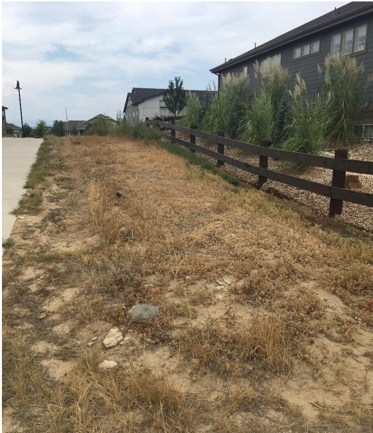
August 2020 – Pre-seeding (weeds treated with herbicide)