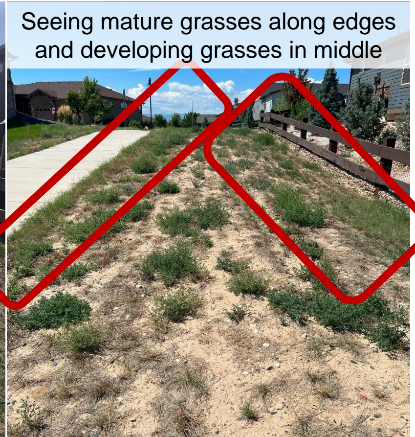
Seeing mature grasses along edges and developing grasses in middle