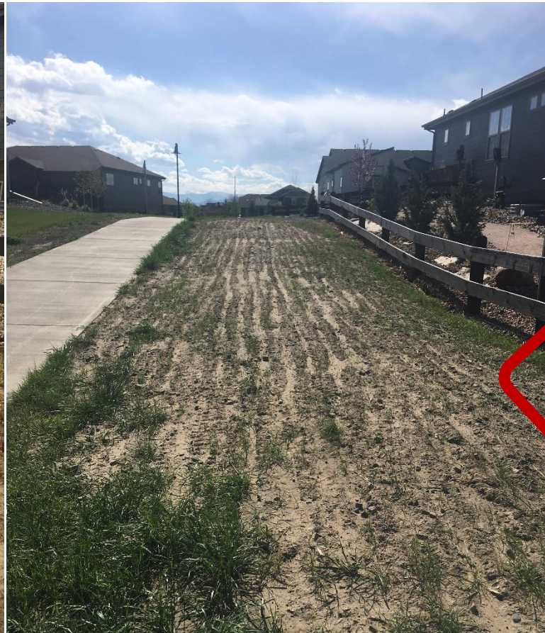
May 2021 – 5 months post-seed (mostly cool-season grasses)